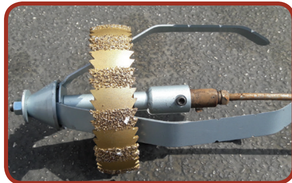
Figure 12-7: An example of a root cutting device used with a mechanical rodder.