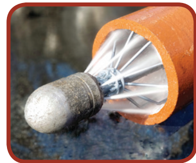
Figure 12-3: Static cleaning hydro-jet nozzle.

Stoppage nozzle - used to break up sewer blockages with the use of forward facing jets and rear facing thrust jets which penetrate and break-up a stoppage.