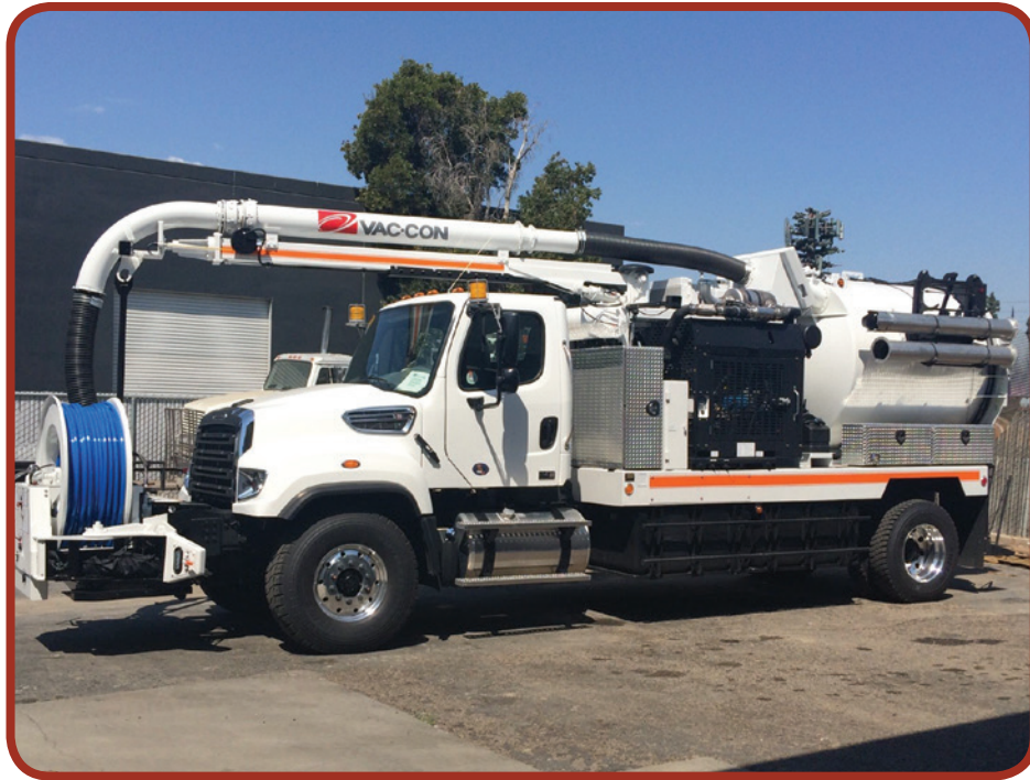
Figure 12-1: A combination sewer cleaning truck is used to hydro-flush and vacuum sewer lines. The nozzles and tools used with similar trucks have advanced dramatically over the past 10 years.