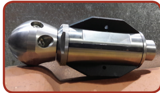
Figure 12-4: A rotational nozzle uses a revolving head to deliver water jets throughout the entire circumference of the pipe.

Rotational Nozzles: A series of nozzles delivering water jets throughout the entire internal circumference of the sewer pipe, using a revolving head.