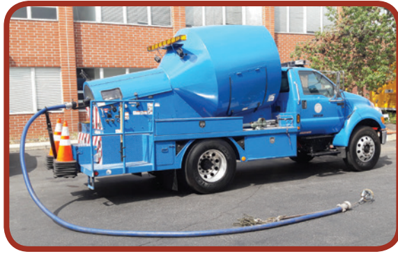
Figure 12-6: A continuous mechanical rodding machine has 1200 feet of continuous rod.

A method of hydraulically cleaning a sewer or storm drain by using the pressure of a water head to create a high cleansing velocity of water around the ball. In normal operation, the ball is restrained by a cable while water washes past the ball at high velocity. Special sewer cleaning balls have an outside tread that causes them to spin or rotate, resulting in a “scrubbing” action of the flowing water along the pipe wall.