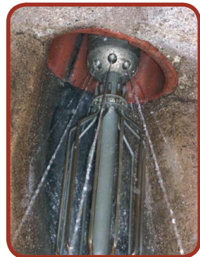
Figure 12-2: Hydro-jetting set-up for an 8" VCP pipe.

Cleaning, repairing and inspecting sewer lines are essential parts of maintaining a properly functioning wastewater infrastructure and protecting the environment. From the cleaning method using hickory sticks and scrapers employed at the turn of the 20th century, to