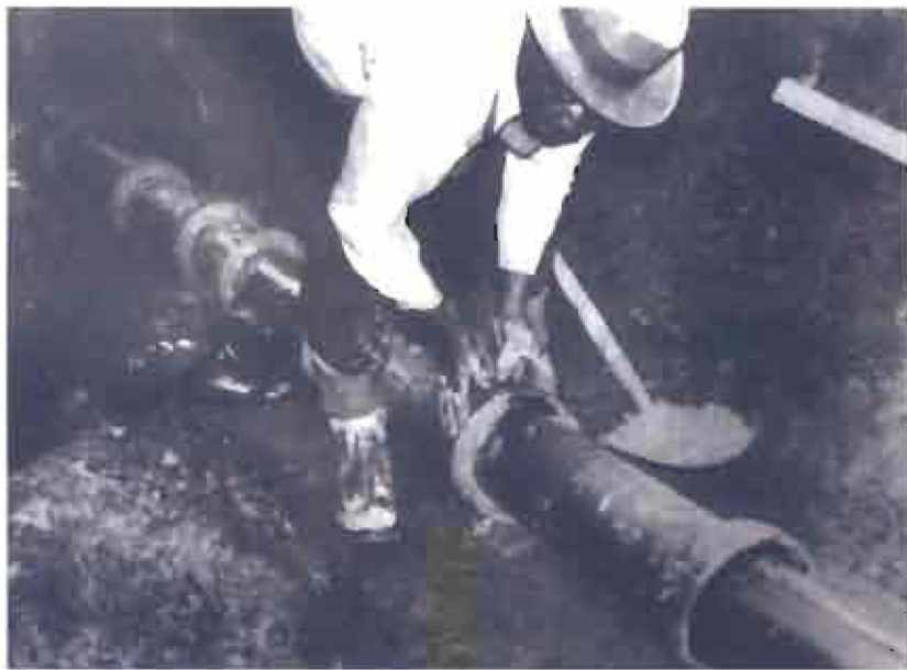
Top to bottom: Early Hot-Pour Field Joints and Early Cement Mortar Field Joints