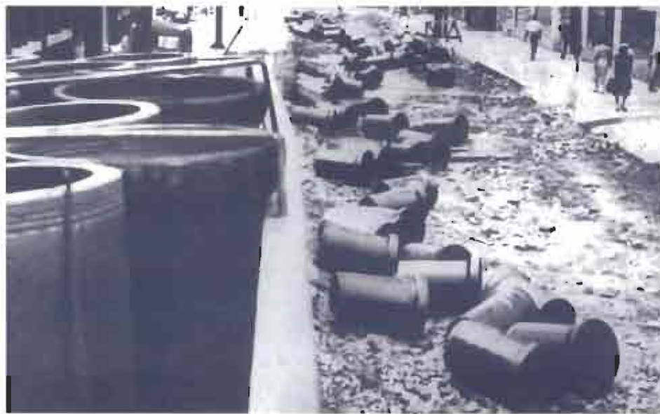
Early Clay Pipes Were Supplied Without Joints

Joints were simply made in the field using hot pour asphalt or cement mortar. These joints, although neither tight nor root-proof, were the standard long before the first wastewater