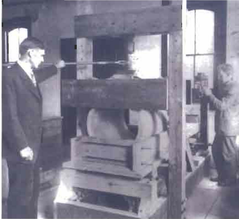
Professor Anson Marston Observing Early Pipe Tests at the Engineering Experiment Station, Ames, Iowa.

appended to the committee's 1914 annual report. In 1915, ASTM accepted these recommendations as a tentative specification designated C 12, Recommended Practice for Laying Sewer Pipe.